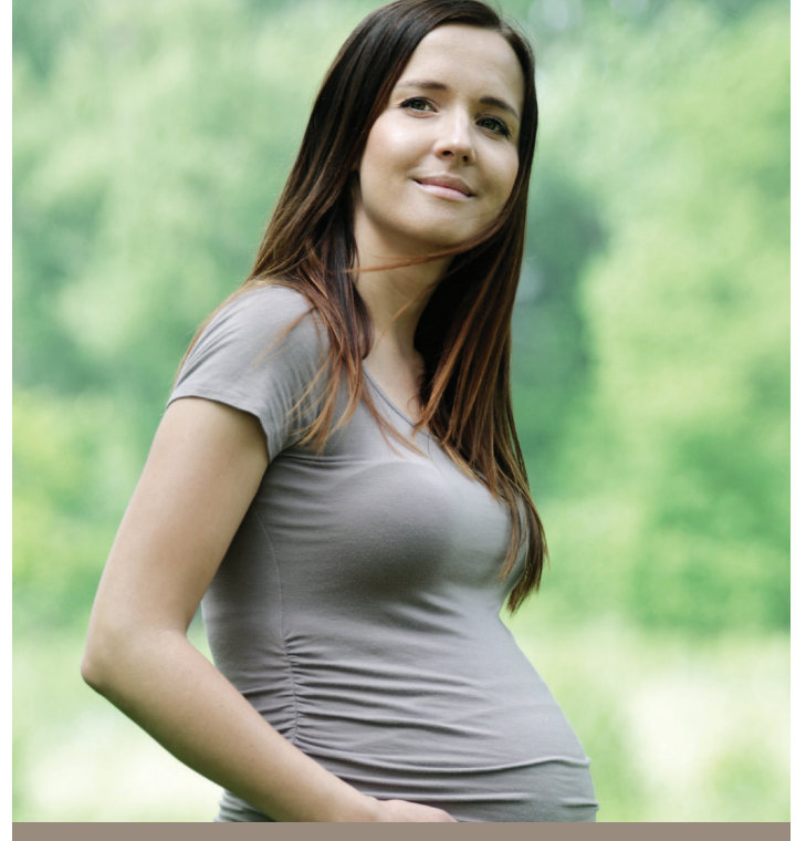
To sign up for e-newsletters, find volunteer opportunities, or donate to provide help and create hope, visit us at CatholicCharitiesTellCity.org.

Catholic Charities will continue to provide help, create hope and serve all in need in our communities. Without your support, none of these efforts and ministries would be possible, and we are deeply grateful for your commitment to our mission. May God bless all of you for your support through donations, volunteerism and prayers.